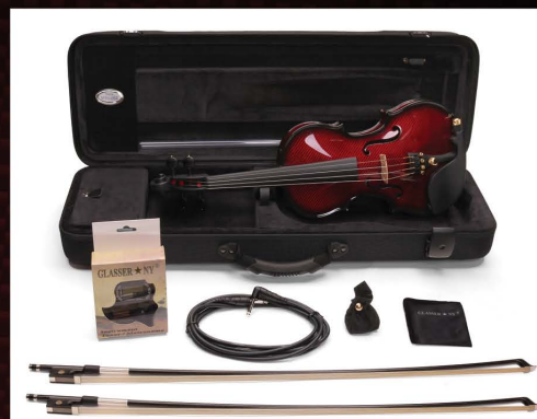
Glasser Custom Shop Acoustic-Electric Outfit: Red Texalium violin in Jakob Winter case

These instruments can be purchased individually or as a part of an outfit. All violin and cello outfits include Glasser bows, cases or gig bags, and accessories that enhance their value to the customer. The Glasser Custom Shop allows you to select custom instruments, cases or bags, bows, and accessories to get your customer their perfect outfit.