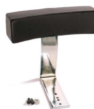
Separate Lumbar Support